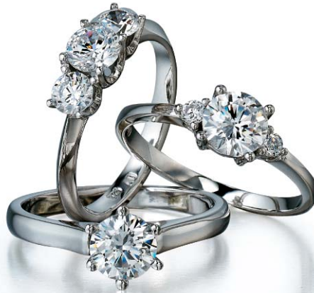
Romantic trio of engagement rings featuring the all time favourite solitaire, a classic trilogy and a contemporary 3-stone ring

Jewel Africa also offers an exclusive retail jewellery experience. Guests can view our extensive tanzanite and diamond jewellery collection, and make informed purchases based on the knowledge gained through the educational diamond tours. They also have the opportunity to purchase loose gemstones or get these made up in a jewellery design of their own creation.