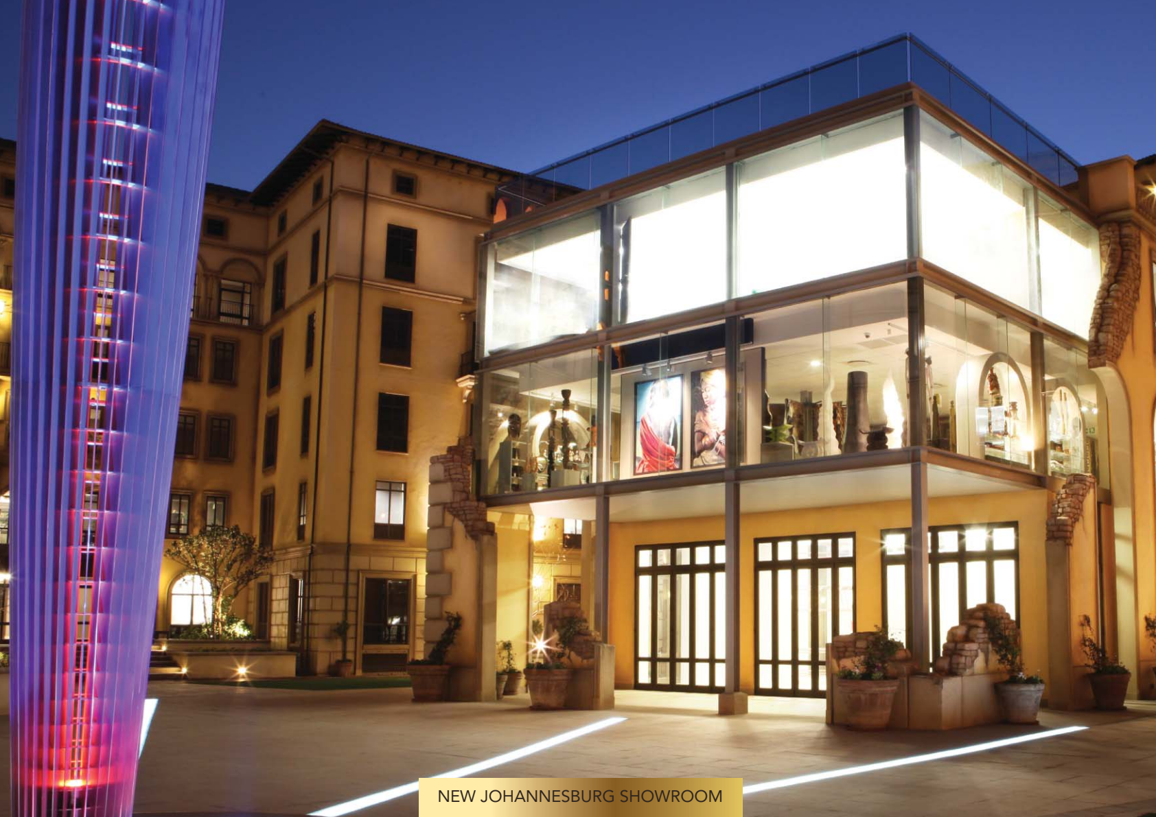
NEW JOHANNESBURG SHOWROOM